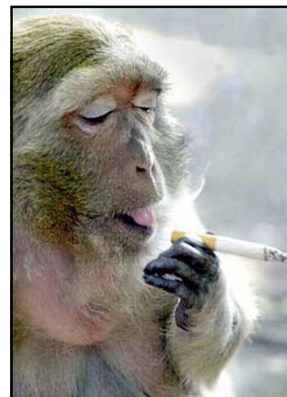
one of the trainees takes a break from the CC program

"Trained monkeys are the future of radio sales," continued Hogan. "They don't complain, they're always on time and they work for bananas. Okay, so maybe they smell like holy hell, so do our current account executives!"