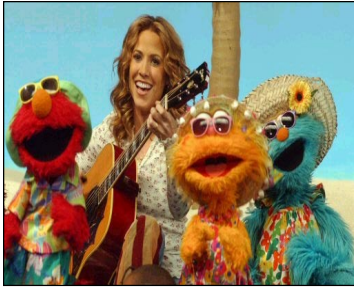
Sheryl Crow announced last week that her new all muppet band would be hitting the road with The Beach Boys in the fall