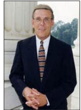
ever get the feeling you've been cheated?

The editorial closed with the Senators urging their associates to join them. “Congress can use the Congressional Review Act to right the wrong done by the new media ownership rules. If we don't, the range of voices that Americans have come to expect, whether we open the newspaper, turn on the television or tune into the radio, will continue to fade away until, ultimately it will come to resemble our political system.”