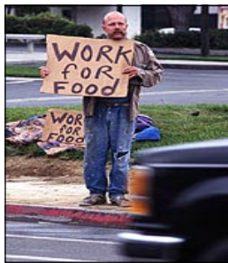
another graduate of the music industry's new retraining program