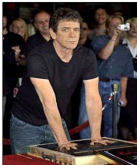
Lou Reed becomes a permanent fixture on Hollywood Boulevard after workers accidentally use quick drying cement